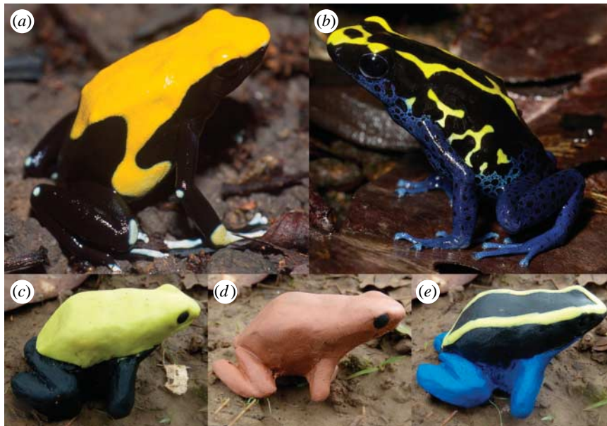
Figure 1. (a) Local and (b) novel phenotypes of D. tinctorius upon which (c,e) models, respectively, were modelled; (d) cryptic model.

mate choice experiments have not been conducted in this species, females, which do not consistently differ from males in any phenotypic characteristic, actively approach and court males (Lötters et al. 2007; B.P. Noonan 2008, personal observation) and some measure of assortative mating similar to that observed in Oophaga is probable. In order to examine ecological forces on polymorphic dendrobatids, we used clay models placed throughout primary forest inhabited by a single phenotypic form of this species, examining patterns of predation on models resembling the local form, a novel form (resembling populations approx. 150 km away) and a cryptic (brown) form.